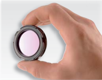
Lens protection glass