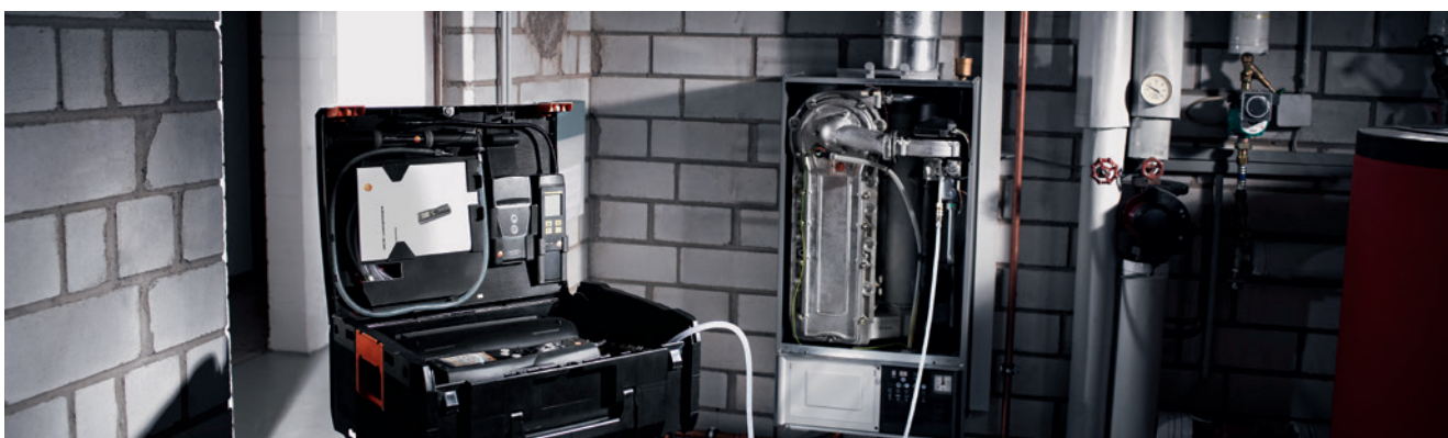
Automatic servicability test with gas-feed appliance with connection to the gas boiler