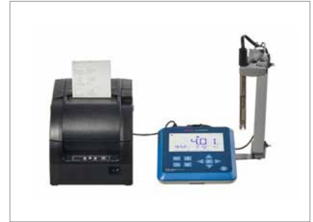
Data logs and calibration logs can be exported via the communication port to a computer or printer.