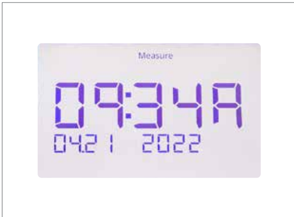
All data logs and calibration logs are date and time stamped for GLP/GMP reporting.