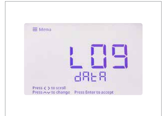
Critical data is automatically saved to the meter's 500-point data log.