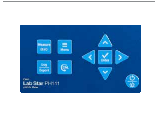
Keypad is designed with buttons for durability in the lab and easy wipe down or disinfection.