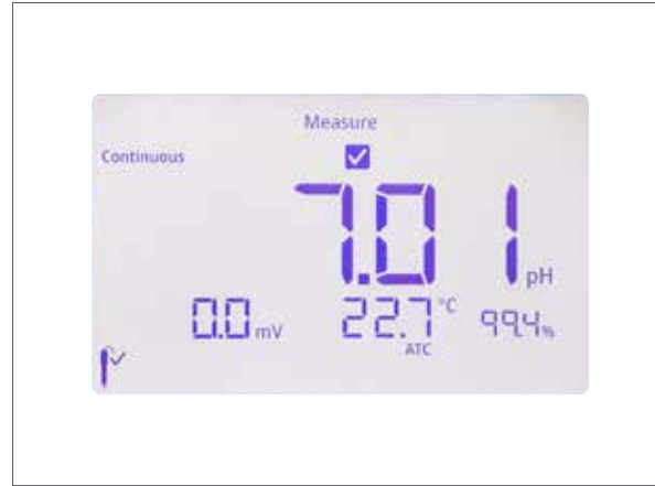
On-screen icons indicate measurement stability statuses, giving you greater confidence in your readings.