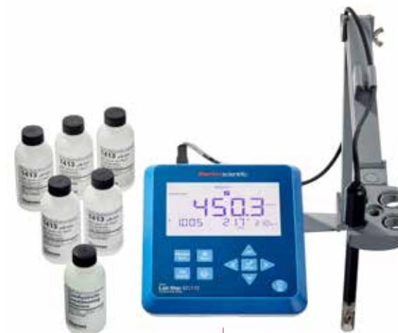
For a wide variety of conductivity samples in the 1 \mu\text{S}/\text{cm} to 20 \text{mS}/\text{cm} range.