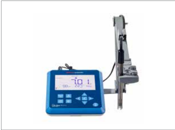
Each meter comes with a stand that helps facilitate electrode movement into and out of samples.